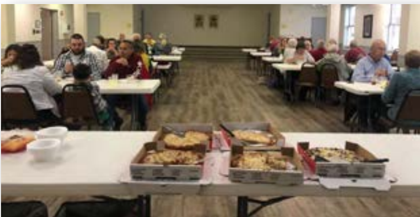
(Photo of 5th Sunday Fellowship Meal on Oct. 29, 2023)